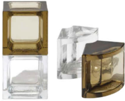
"These upcycled glass bricks add a beautiful architectural detail indoors or out." Eco Outdoor Mano glass blocks , eco-outdoor.com