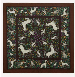
"All the best-dressed Londoners wear Drake's, and for me, their bandanas are a must-have." Drake's Unicorn print wool-Silk bandana in brown , us.drakes.com