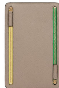
"The ultimate travel accessory to keep everything in order." Smythson multi-zip case in Panama-Sandstone , smythson.com