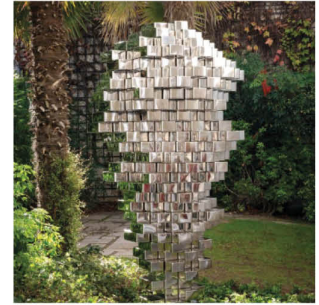
"A garden's crowning glory can be a sculpture—Jean-Michel Othoniel's work is truly elevated." Jean-Michel Othoniel, Yardang, 2025 (mirrored stainless steel, 229 x 100 x 100 cm.) , perrotin.com