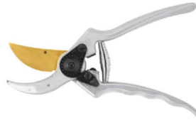
"Every artist needs the best tools they can find, and these shears certainly fit the bill." Felco 80th Anniversary shears , america.felco.com