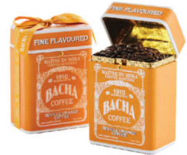
"This has become my favorite morning go-to treat after discovering it in Marrakesh." Bacha Coffee Seville Orange coffee , bachacoffee.com